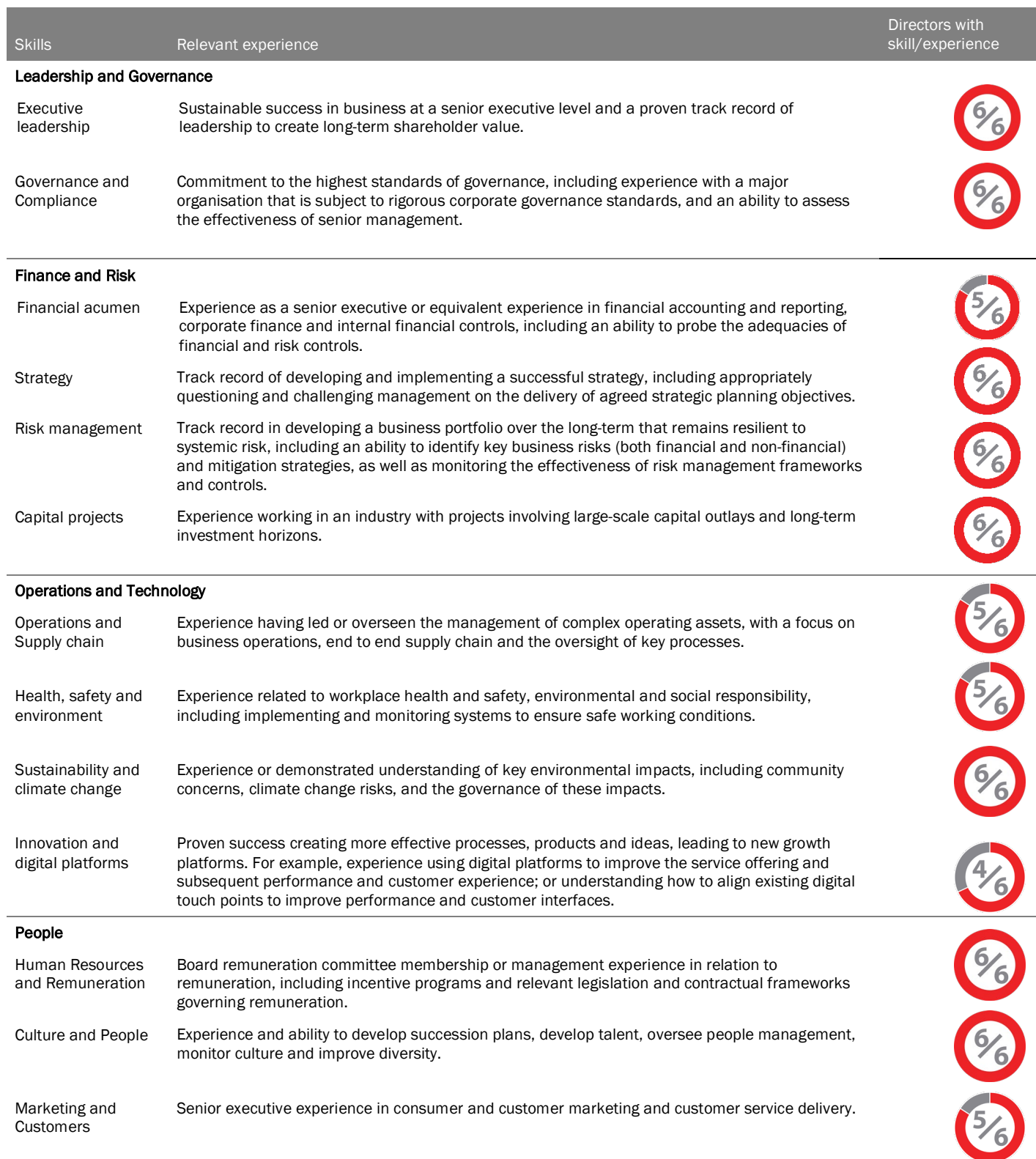
Table 2: Summary of board skills and experience