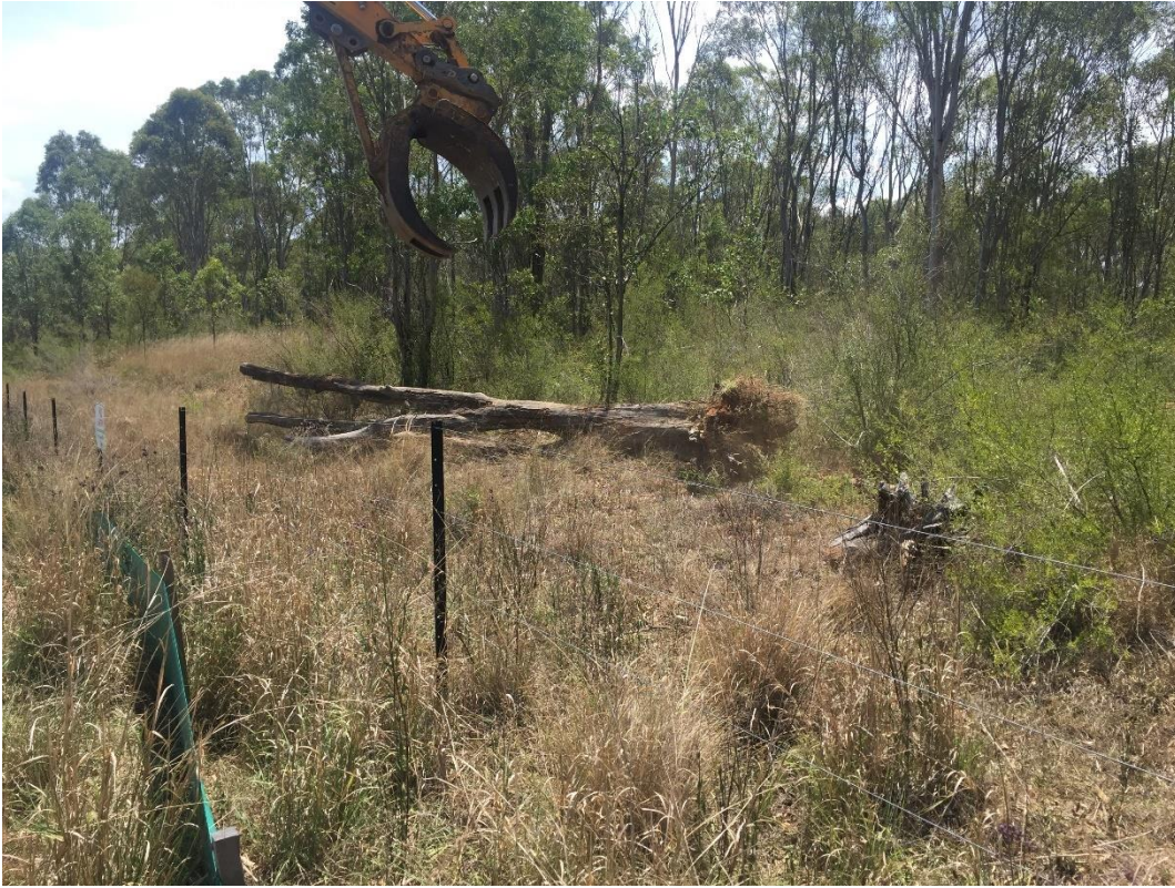
Figure 5: Placement of retained logs and hollows in the conservation lot