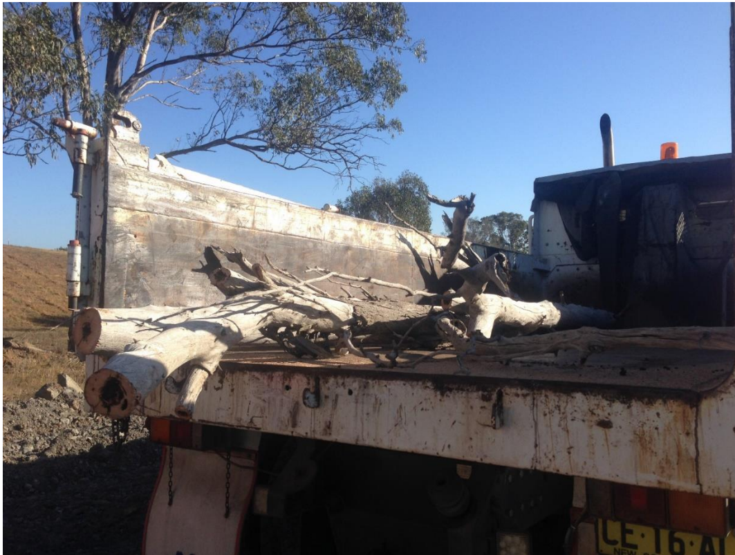
Figure 3: Retention of hollow sections for installation in the conservation lot